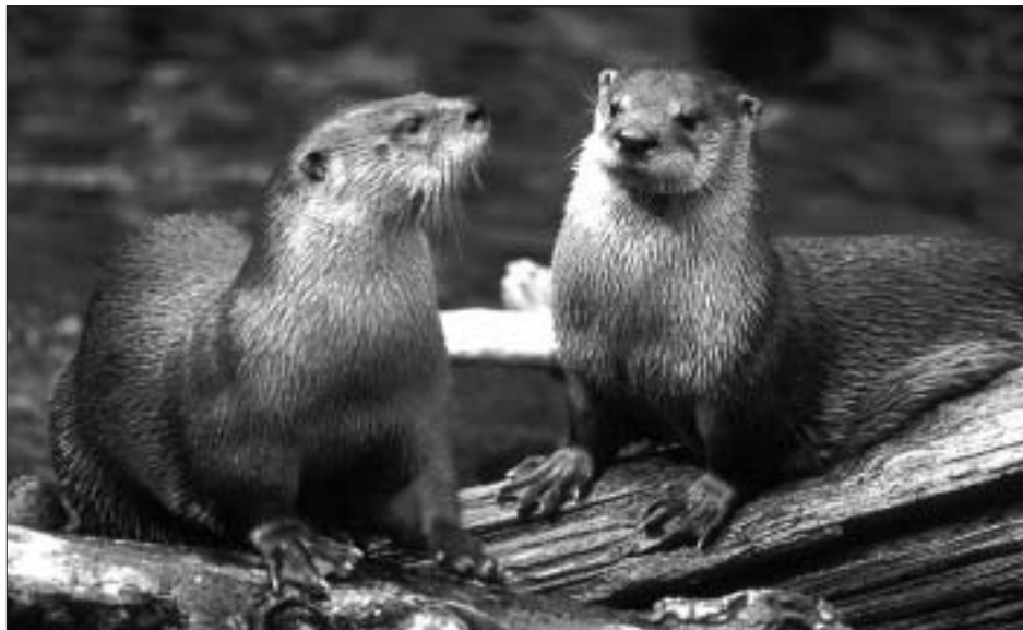
North American River Otters